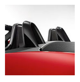
ROLL OVER PROTEC-TION BARS